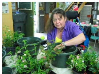
May: New West Summer annuals.