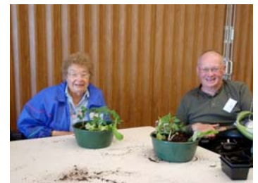
April: Plotting planters.