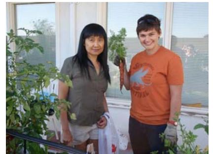
Pearson success: Carrot harvest!

Yule love it: DIGA’s next workshop will enable participants to create a “Yule Log Festive Centerpiece.”