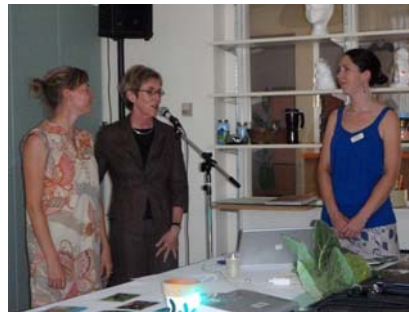
Pearson party: celebrating success.