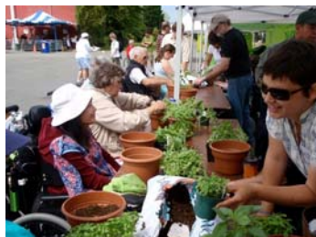
June: Herb planters at PNE.